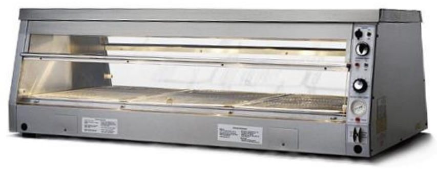
HCW 3 display counter warmer with flip-up doors for pass-through service

Henny Penny display counter warmers are designed for accumulating, holding and displaying hot fresh food for serving or packing at the point of sale in retail foodservice operations.